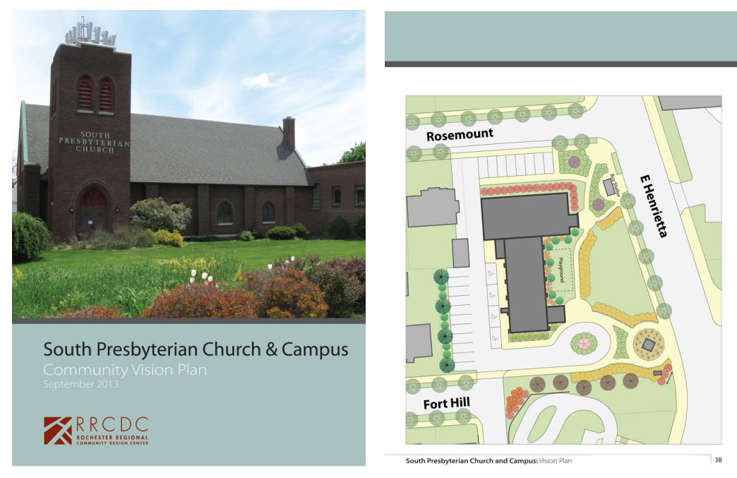
Excerpts from South Presbyterian Church and Campus Community Vision Plan

the Rochester Regional Community Design Center.